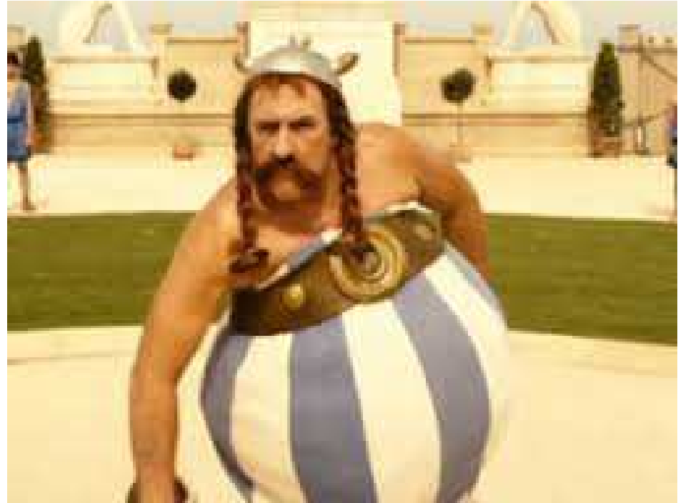
Gérard Depardieu as Obélix